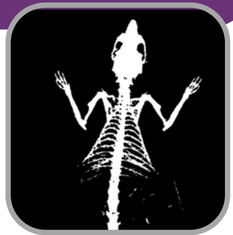
Bone Mineral density